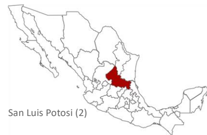
San Luis Potosi (2)