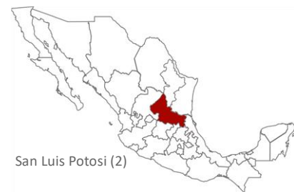
San Luis Potosi (2)